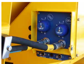
Spread width/application rate control on the machine