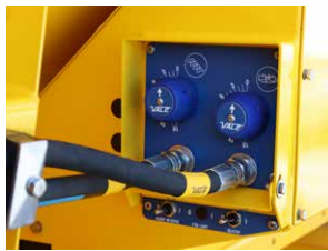
Spread width/application rate control on the machine

The simplest way to control the spreader is by using the tractor or towing vehicle's own functionality to operate the spreading action. By using the tractor spool valve, this starts and stops the spreading action so a control box is not required.